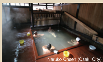
Naruko Onsen (Osaki City)

Nakayamadaira Onsen (Osaki City) 中山平温泉(大崎市) This spa features the greatest volume of water in Naruko Spa Village and is known as the "spa for beautiful skin."